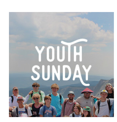
Sun | May 1 | 10:45 AM

FPC Seniors will help lead the Contemporary liturgy and 8th grade Confirmands will be welcomed as church members.