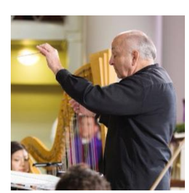
Sun | May 15 | 11:45 AM

FPC Seniors will help lead the Contemporary liturgy and 8th grade Confirmands will be welcomed as church members.