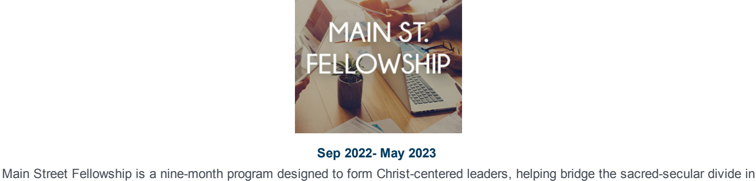
their work. Apply by June 17.

and join in on fun social gatherings. Learn More >