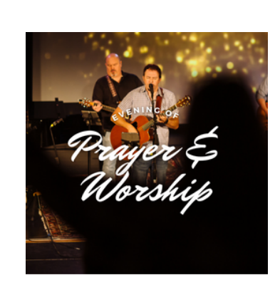
Sun | Jun 26 | 5-6 PM | Chapel

Join us for an evening set aside to draw near to God as He draws near to us through pastor-led prayer and meaningful worship. Learn More >