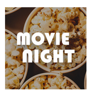
Sat | Jul 16 | 3-7 PM | LC080

Join us and invite a friend for snacks and discussion as we watch The Lord of the Rings: The Two Towers. Learn More >