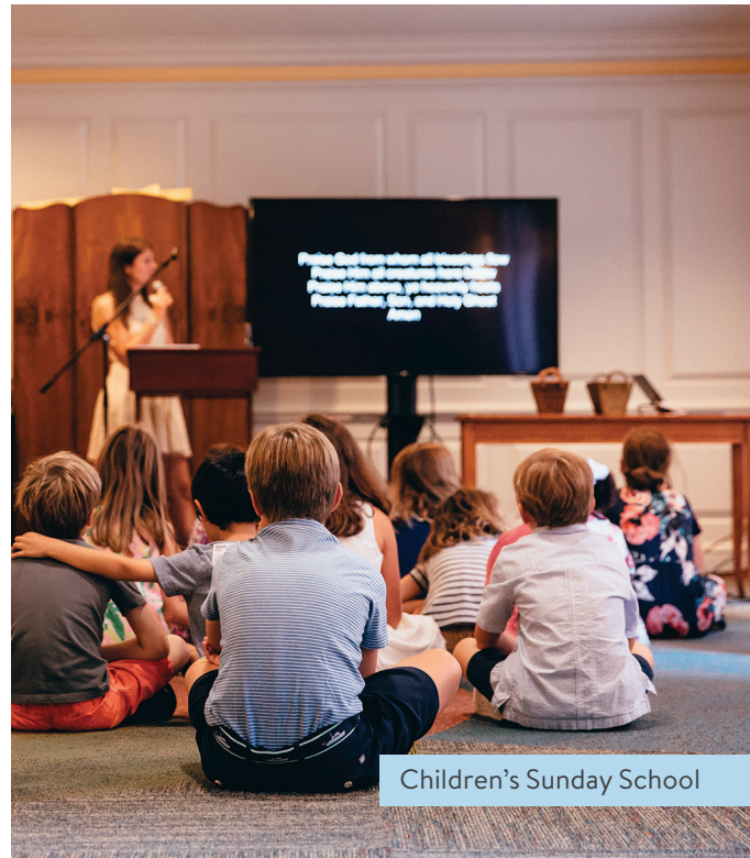
Children's Sunday School