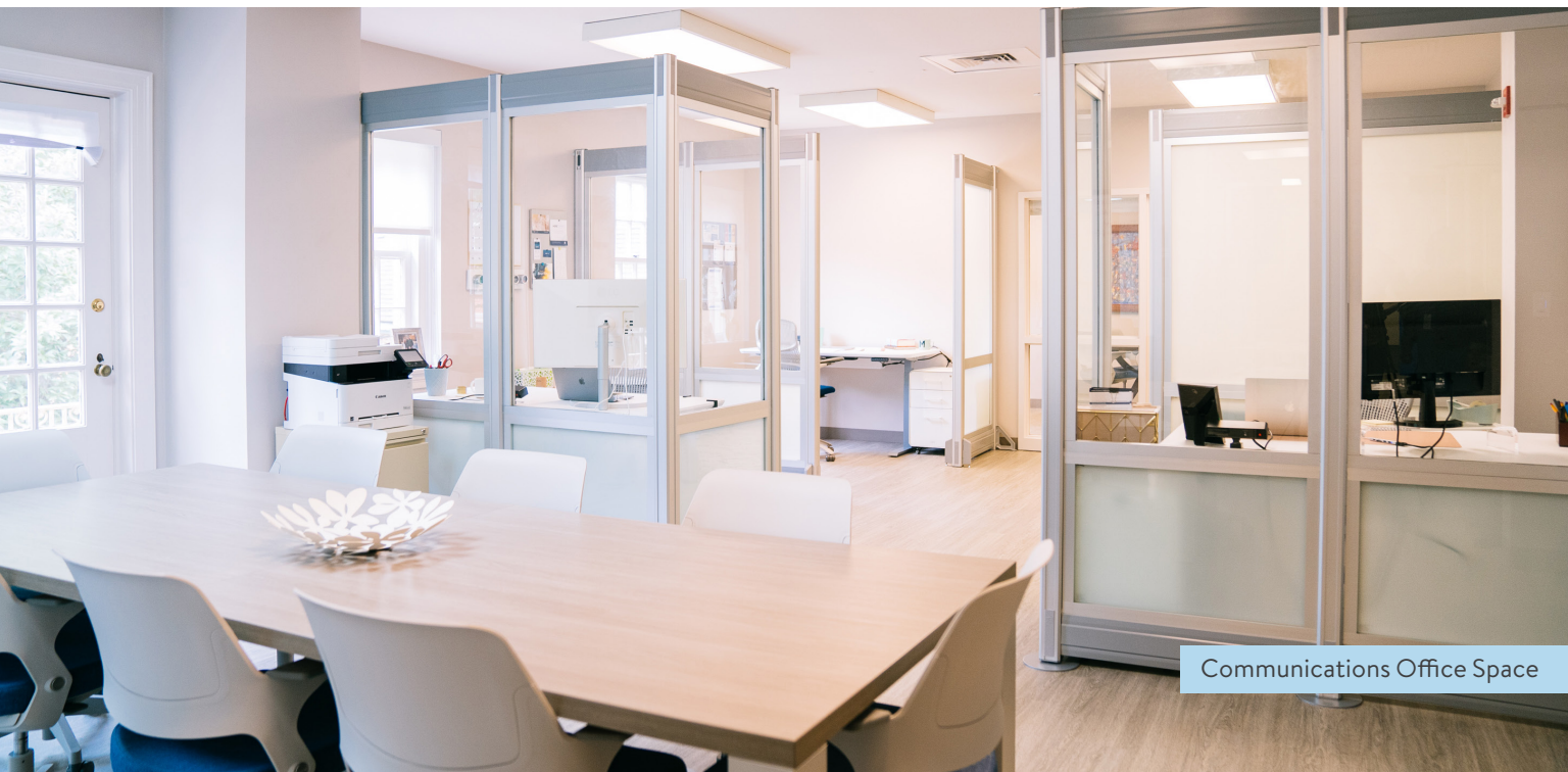
Communications Office Space