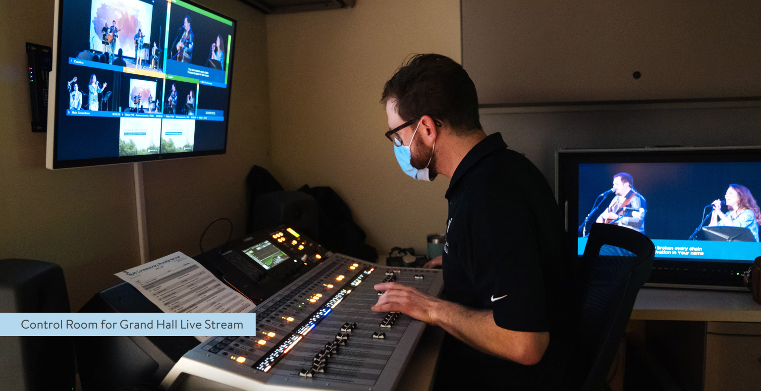
Control Room for Grand Hall Live Stream