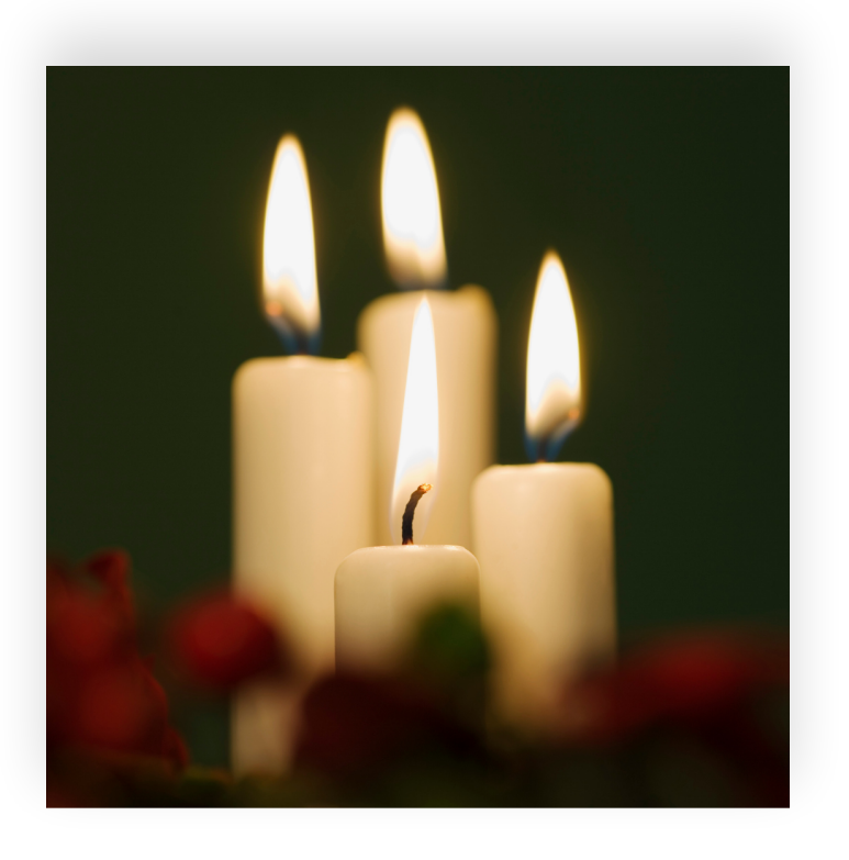
Advent Guide 2024